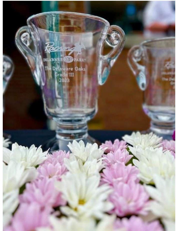
The Delaware Oaks Grade III 2023

In 2023 Delaware Park paid out a total of $18,477,000.00 in purse money for the 85-day meet. A decrease of ($2,776,000.00) from the previous 87-day meet in 2022.