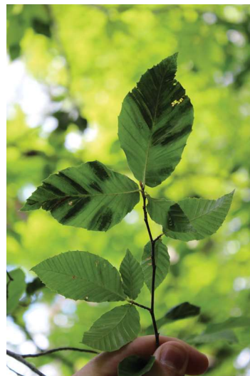
Figure 1.—Banding appearance associated with BLD.

BLD range appears to be spreading primarily toward the east based on the locations of new county detections in recent years. The nematodes are possibly dispersing aurally by wind and precipitation. Additional nematode dispersal modes currently being studied include insect and avian vectors as well as human-mediated movement. There is likely a delay between initial nematode infestation and BLD detection as L. crenatae has occasionally been confirmed in asymptomatic tissue at the molecular level before symptoms are observed.