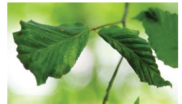
Figure 2.—Banding appearance and shrunken leaves associated with BLD.