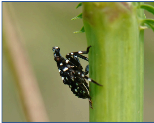
Early Nymph found in late spring