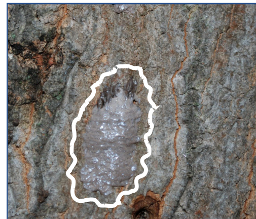
Fresh Spotted Lanternfly egg mass on tree bark (outlined in white). Present in fall and winter, blends in with surroundings.