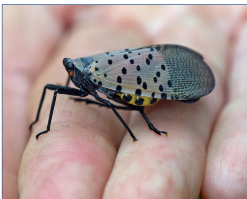
4th instar - Adult - late summer / fall.