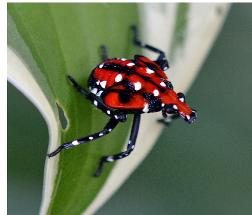
Late Nymph found in summer prior to adulthood